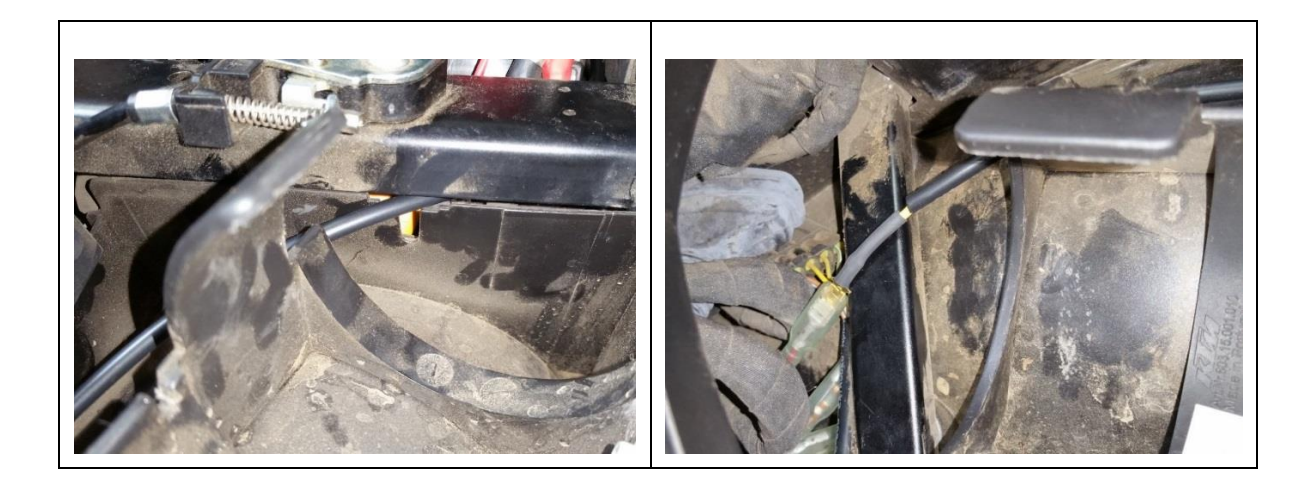
Figure 15 and 17

Note: A parallel connection may be necessary if this accessory wire is already being used.